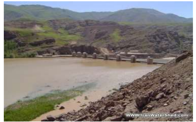
Figure 4: Dam Taleghan