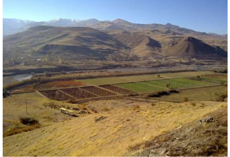
Figure 3: Agricultural land of area Taleghan

Taleghan area due to differences in altitude and topographical diversity, 510 plant species, including 30 species of medicinal, 22 types of grassland and Different communities and Shrubs such as juniper, beech, oak, mastic, oak, hawthorn and... (Nikcar, 2011). Figure 3 indicated Agricultural land of Taleghan area.