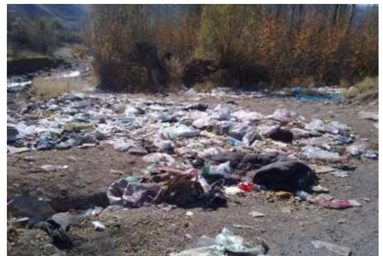
Figure 5: Trash along the river and the regional health planning

The Percentage of Landscape metrics showed that the garden area was increased by 2.28 percent, while agricultural land was decreased by 15.5 percent. Grasslands increased 16.25 percent and bare lands to 28.08 percent (Fig. 6). From the ecological concept, due to the increasing surface area of the bare lands and decreased grasslands, it can be concluded that vegetation cover was destroyed. But agriculture land decreased intensely; it can be caused by the existence of the Taleghan reservoir and more can be caused by the release of the dry plains which these lands were converted to pastures over time with weak density.