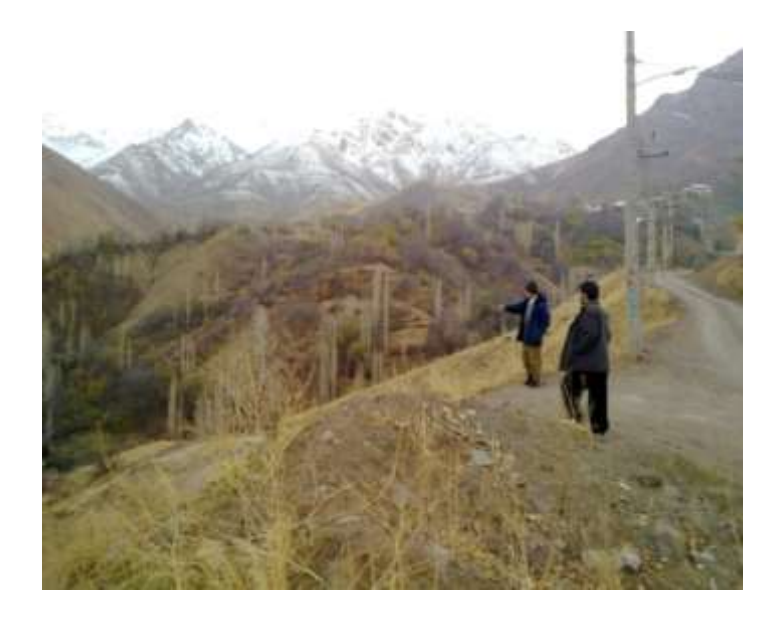
Figure 2: Visits to this area (outman, 2010)