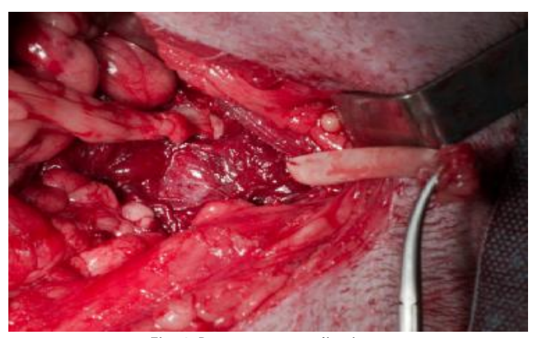
Fig. 4. Prostate omentalization.