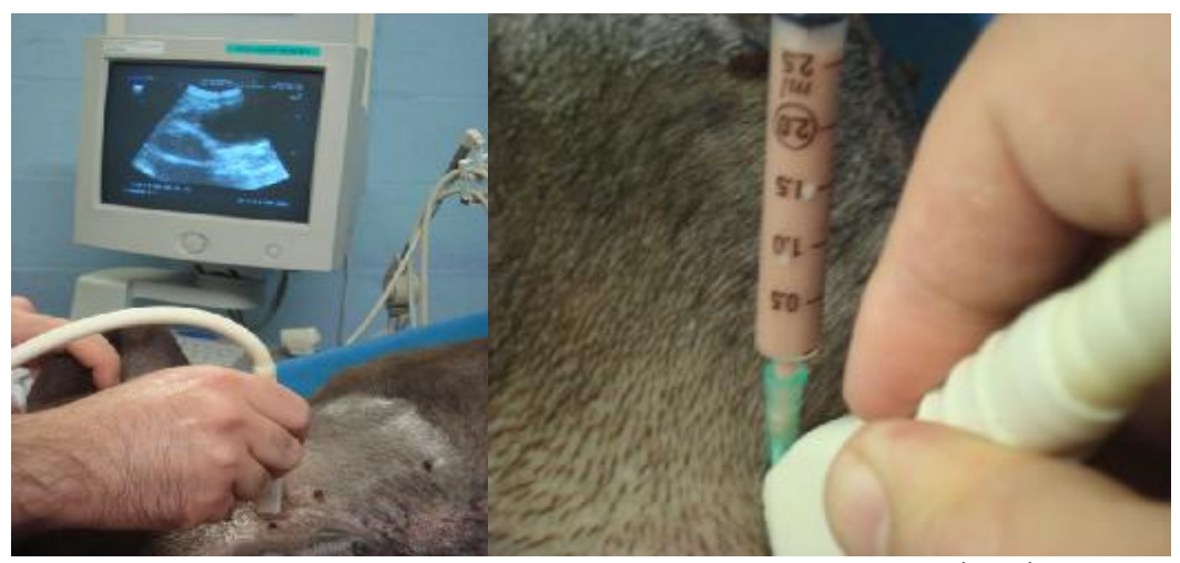
Fig. 2. Trans- abdominal ultrasonography fine needle aspiration biopsy (FNAB).