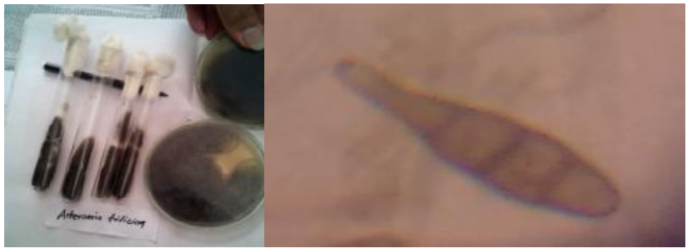
Fig. 1. Cultuer of Alternaria triticina.