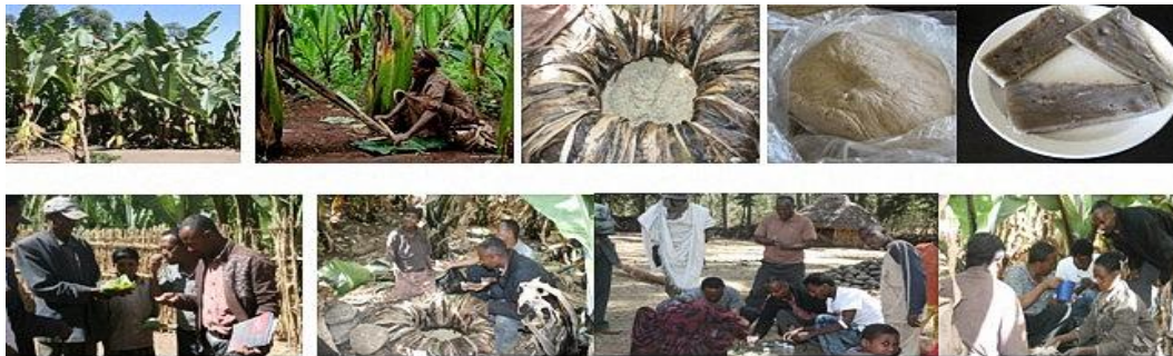
Fig. 2. Left to right 1. Enset ( Ensete ventricosum ), 2. Kocho processing, 3. Kocho in the earthen pits during fermentation, 4. Kocho ready for food, 5. Kocho Bread, 6. Researcher during kocho sample collection.

Three hundred Kocho and bulla samples were collected aseptically from 5 to 25 cm depths in the earthen pits of kocho processing area. Samples of actively fermenting Kocho and bulla were collected from different household sites in KambataTambaro Zone from Angacha district in different Keble, Amberchibasera, Gubenachafa, Shamimba, Amberchi future, Bucha, keelema, kerekichoshino, Gerbafandedae, Ashena. The samples were obtained from different sites within 2100-25 53m altitude ranges and different stage of fermentation. The sample was immediately transferred into sterile sample tube and transported to the microbial Directorate laboratory at Ethiopian Biodiversity Institute (Fig. 2).